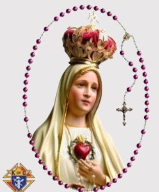
MARY QUEEN OF THE KNIGHTS PRAY FOR US