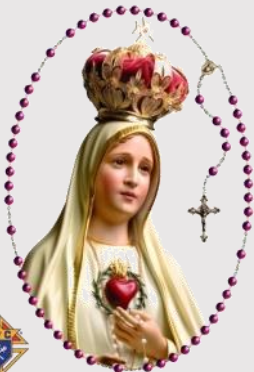
MARY QUEEN OF THE KNIGHTS PRAY FOR US